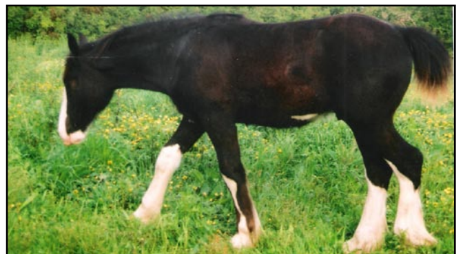
Wolf Mound's King of Hearts at 8 months