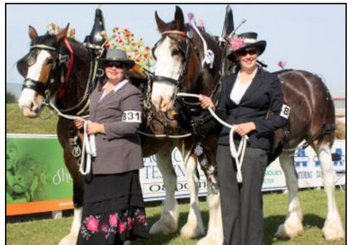
Two Kent sisters with two Clydesdale sisters