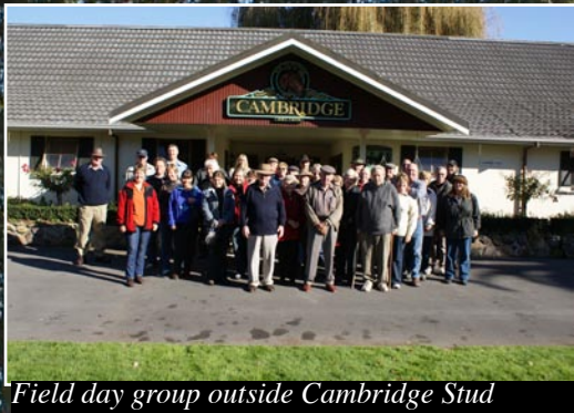
Field day group outside Cambridge Stud