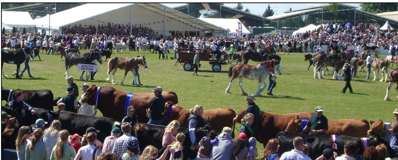
The Royal Show Canterbury is certainly an event not to be missed