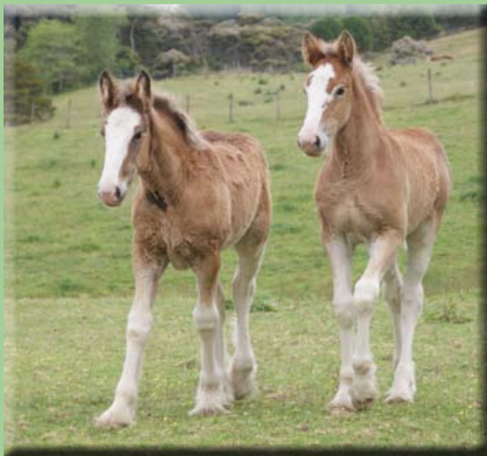
Kia Kaha Kestrel and Kia Kaha Crumpet