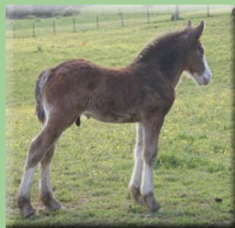
Kia Kaha Boxer