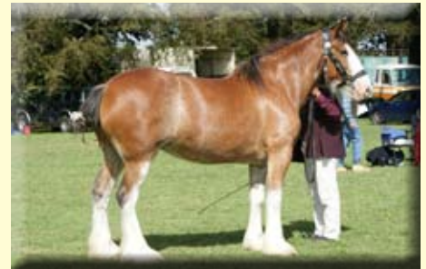
Ashburn Craigs Kimberly