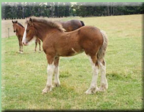
An Erewhon foal as yet unnamed