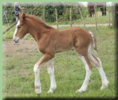
First foal for Ashburn Craigs Kate