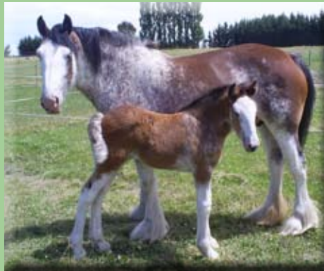
Woodbury Ruby and foal - Woodbury Scarlett