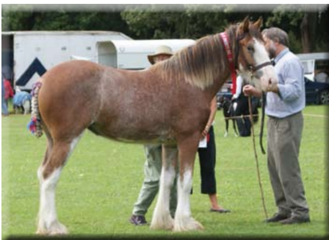
Bruce Signal with Sugar Creek Nell