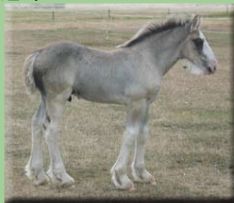
Drummer - perhaps about to turn black?