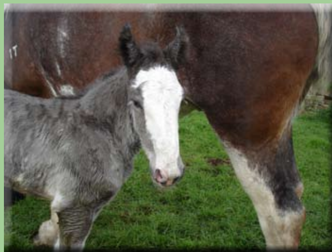
The Donovan's latest foal out of Bonnie