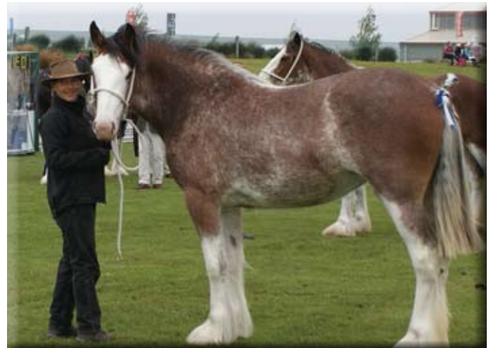
Gaye Day with Dayboo Anja