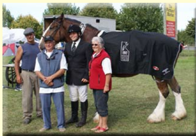
Taungatara Chiefs Cody with owner, rider and support team